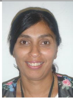
Dal Key person